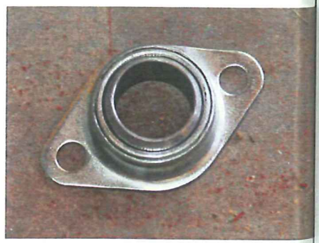
While placing my order for the kit with Gas Alley I opted to go with the suggested (but still optional) support bearing. The added support it offers will help keep any torsional effects to the steering box mounting to a minimum.