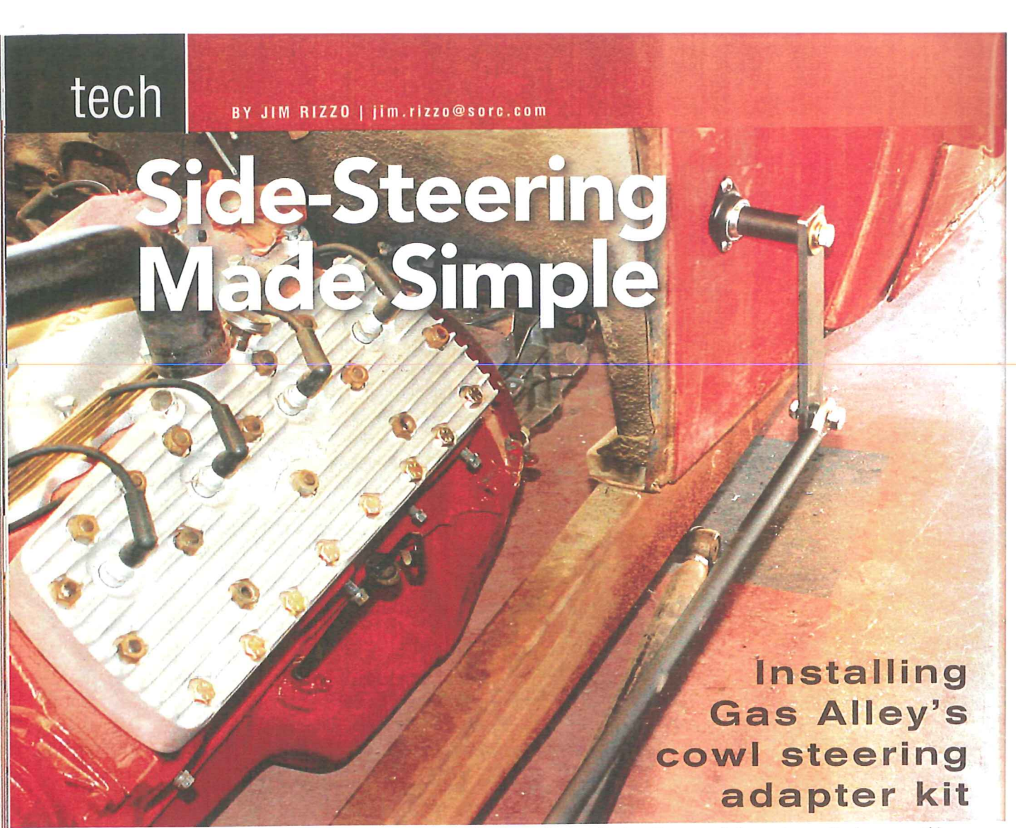
Gas Alley Street Rods has worked out a neat little conversion kit that makes putting together a cowl-steer setup pretty darn easy. This installation was accomplished in a weekend with more time spent figuring out my box location and specific mounting bracket fabrication than actually assembling the conversion components.

few weeks ago I wrote a short blog on our STREET RODDER website (www. streetrodderweb.com) regarding my discovery of a cowl-steering conversion kit made and sold by a company called Gas Alley Street Rods, and promised to show the conversion kit in use. Well, I finally did get around to doing the install and shot some photos of the process.