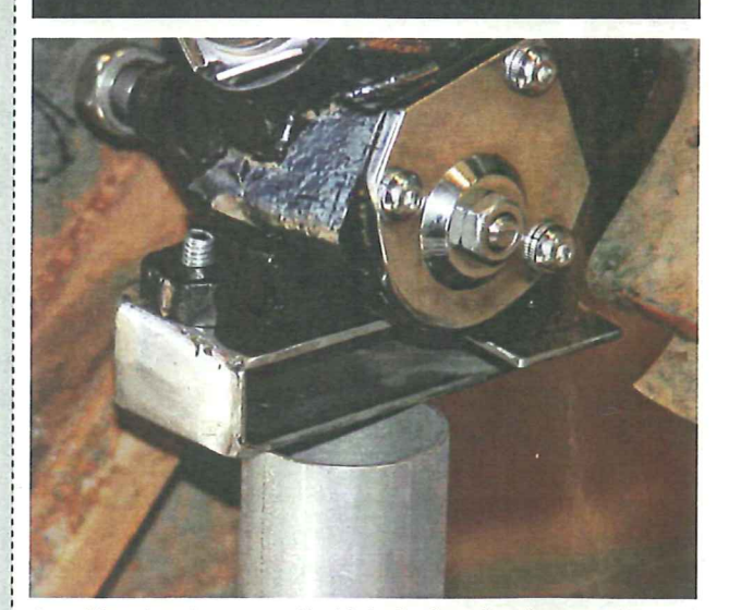
One thing that threw me off a bit is the fact that the mounting pad on a Corvair box is not horizontal—in other words, in order for the output shaft to be perfectly horizontal the mounting plate has to be tilted to the right by about 20 degrees or so (don't take my word though cuz I didn't write down my measurement).