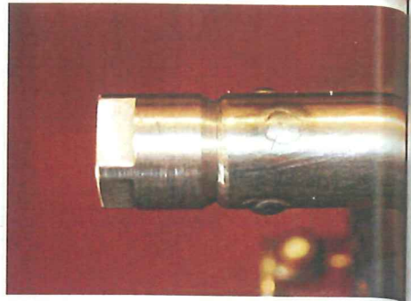
I started by doing the rosette welds first, then going back and filling the V where the machined end met the beveled end of the extension tube.