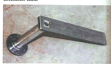
Before proceeding I took a few minutes to test fit the Pitman arm and then to prime and paint it and the shaft before reattaching it to the output shaft adapter.